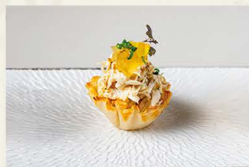
Chilled Crab on Phyllo Cup