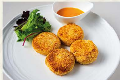
Mini Crab Cake