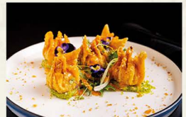
Spicy Tuna Gyoza