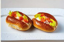
Mini Lobster Roll