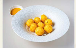
Crispy Risotto Ball