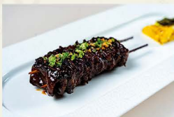
Char-Grilled Beef Ribbon Skewer