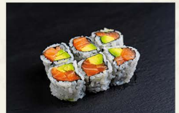
Classic Roll (6 pieces)