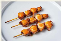
Charred Octopus Skewers